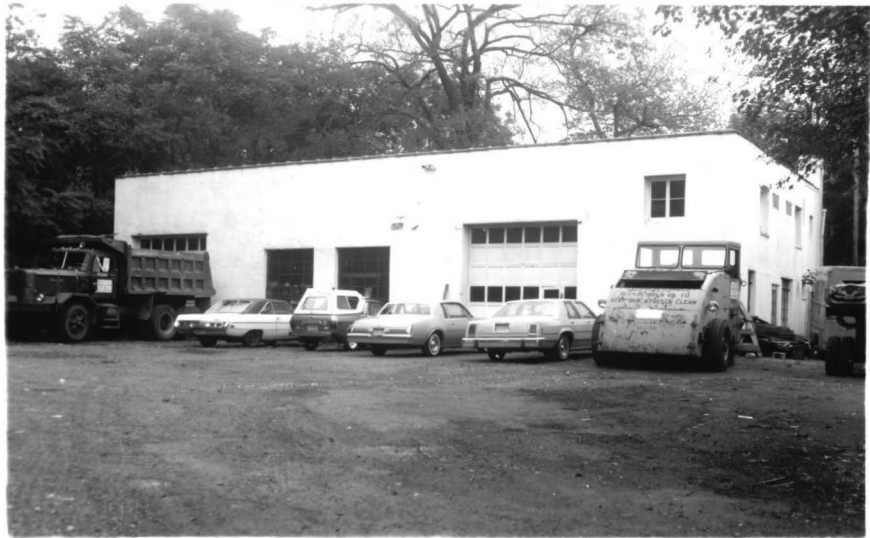
Board of Realtors of the Oranges and Maplewood

28947 (1) 15-13 JEFFERSON AVE., MAPLEWOOD A